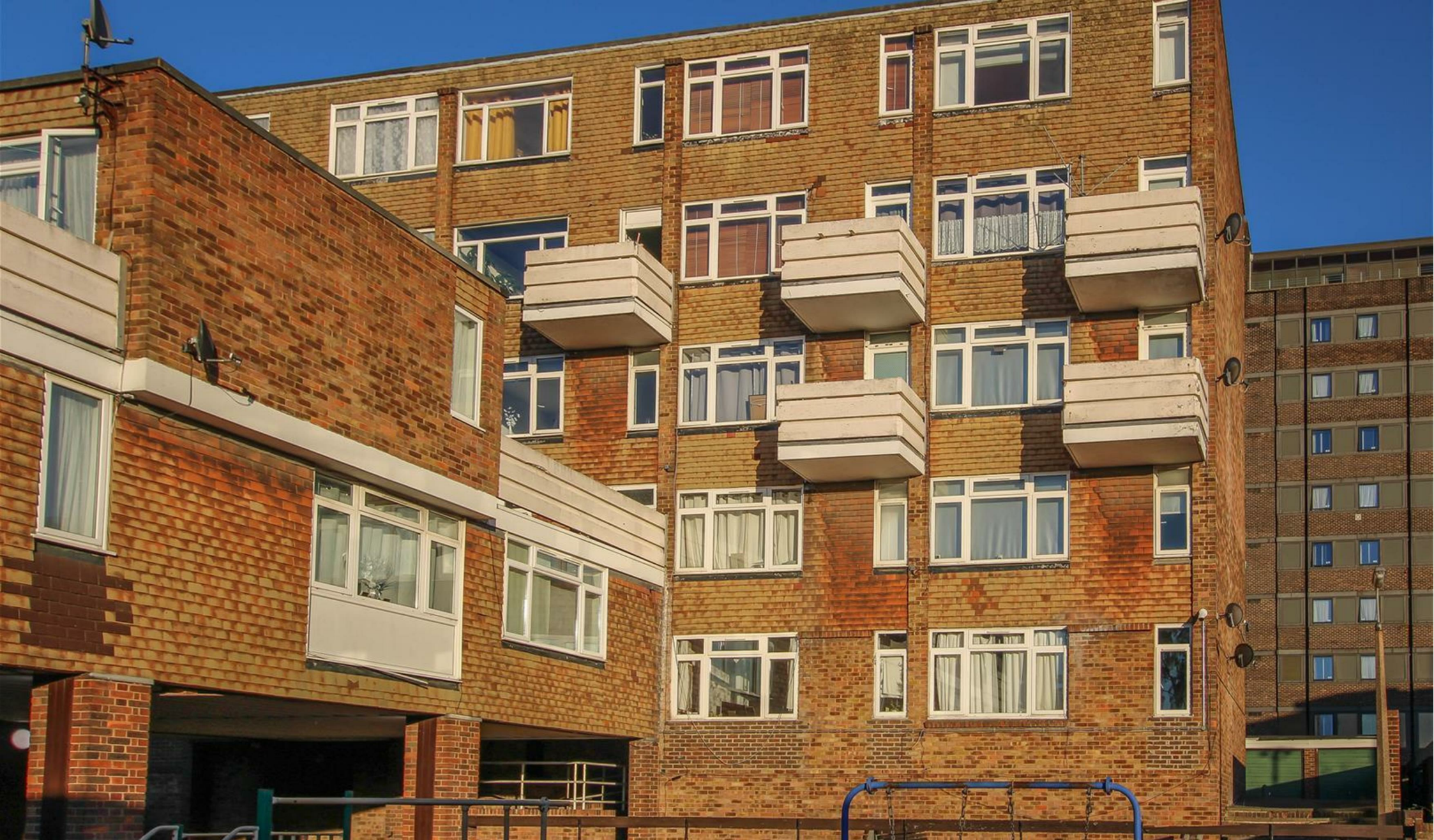
Keith Ashton Railway Square, Brentwood